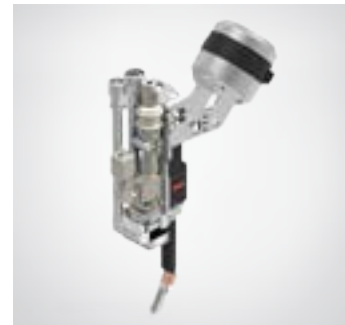
4 KW / 6 KW ULTRAKOMPACT