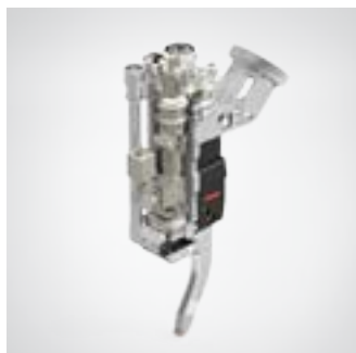
6 KW ULTRAKOMPACT TWIN