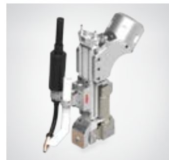
10 KW FILLET WELDING HEAD