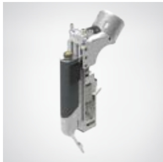
10 KW TPS/i WELDING HEAD